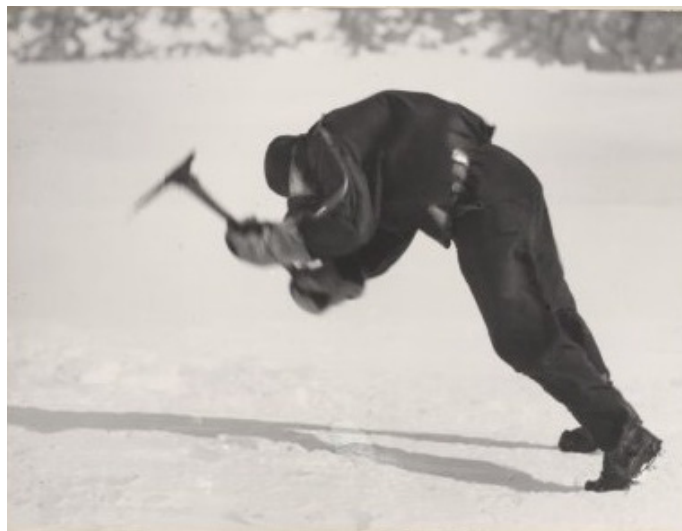
Strong winds at Cape Denison