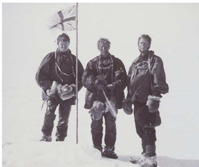
David Mackay and Mawson raise the flag at the Magnetic South Pole on 16 January 1909