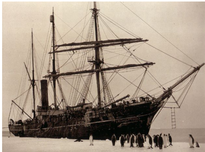
SY Aurora skippered by Captain JK Davis